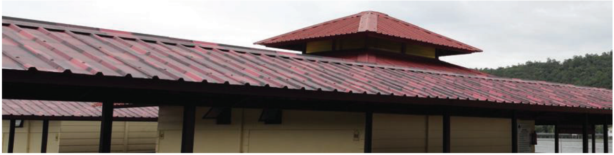
HSRM Hideck® Roofing